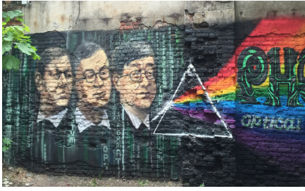
June 2015 // St. Petersburg, Russia Street art in commemoration of the International Year of Light