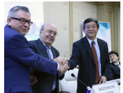
December 2015 // Moscow, Russia International Consortium of THz Photonics and Optoelectronics established with 71 partners from 15 countries.