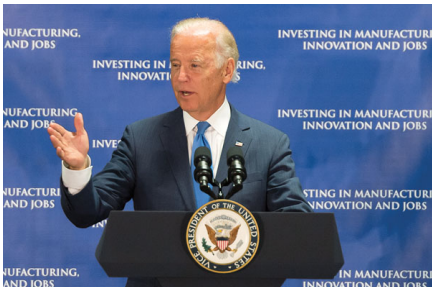
July 2015 // Rochester, NY Vice President Joe Biden speaking on the new photonics center