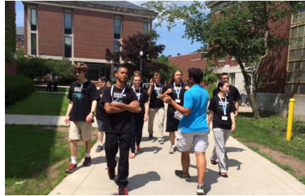
July 2015 // U of R Photon Camp students on a tour of the University's River Campus