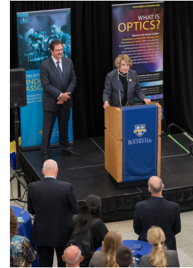
November 2015 Rep. Louise Slaughter addresses the Optics community at the Fall IA meeting reception